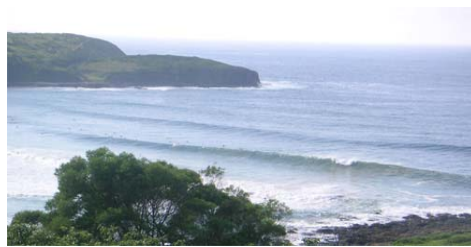
The waves at "The Farm"

There is going to be meetings in May and all of the community groups who have involved themselves in discussing this development will be there. I look forward to reporting on this development in the further.