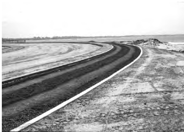
Figure 2: Construction of the Surfers Point parking lot and bike path, 1989.

Statewide, this infrastructure has in many cases been damaged by coastal erosion, often as a result of poor coastal planning leading to inadequate setbacks from a dynamic shoreline. Because one of the primary mandates of the California Coastal Act is to provide for public access, concessions are often made to provide public infrastructure without full consideration of the long-term impacts to placing such facilities in a hazard-prone area. The situation near the mouth of the Ventura River is certainly an example of this.