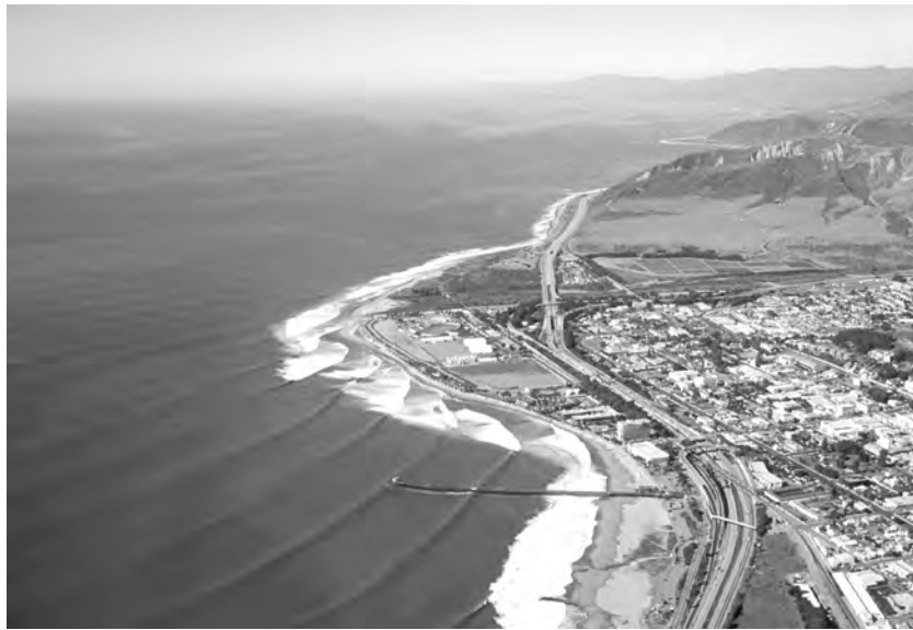
Figure 1: Ventura River delta, November 1999.

In 1997, the southern steelhead trout was added to the federal list of endangered species. The Endangered Species Act requires that recovery actions be taken to achieve the goal of de-listing the species. (Finney & Edmondson, 2001) As a result, the fisheries issue has been the driving force behind many of the existing watershed-based planning and restoration efforts in the state.