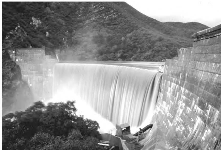
Figure 5: Matilija Dam spilling during a 5-year storm, March 2001.

Matilija Dam has never provided any flood control capacity, and its purpose for water supply diminished significantly with the construction of a primary domestic water supply at Casitas reservoir in 1954. Then, in 1965, only 13 years after the reservoir first filled with water, structural concerns led to the removal of a 35-foot notch to reduce the dam's capacity. As shown in Figure 5, even small floods overtop the structure. The dam is obsolete, ineffective for flood control, and has limited value for water supply (ACOE 2002).