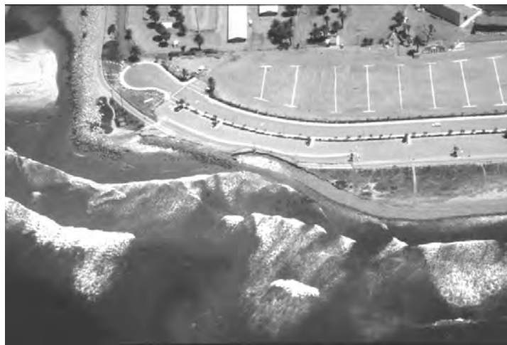
Figure 3: Parking lot and bike path near the mouth of the Ventura River, 1995.

In 1989, a bike path and parking lot were constructed on artificial fill placed adjacent to the beach. As Figure 2 shows, these facilities were placed within the oceanfront corridor at Surfers Point and encroached upon a remnant dune formation. The increased public access soon led to the destruction of the dune resource. (Capelli 1991) This development was approved through an amendment to the Local Coastal Plan (LCP) in order to provide for “public uses and development, including a public roadway, walkways, bikeways, parking and other infrastructure incident to public access and recreation” within the 250-foot setback designated as the “oceanfront corridor.” (City of San Buenaventura 1989) This policy adjustment to accommodate the new development compromised the intent of the previously designated setback, and is the primary cause of the problems that followed.